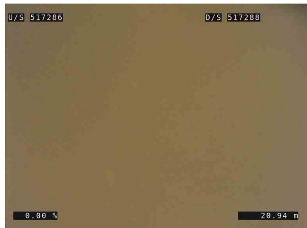
8, 00:02:49, 20.94m (0.06m) Debris silt, small, clear diameter reduced by less than 10%, end / Gravel mud