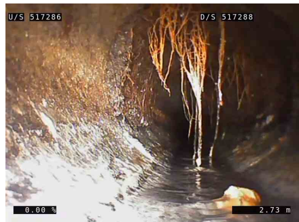
4, 00:01:06, 2.73m (18.27m) The sealing of the joint is faulty, large, clearly through the pipe wall from 8 o'clock to 4 o'clock / RIFM