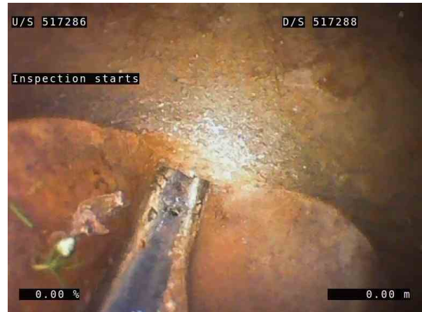
2, 00:00:00, 0.00m (21.00m) Inspection start, node reference: 517286