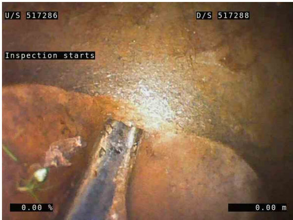
1, 00:00:00, 0.00m (21.00m) Inspection start, node reference: 517286