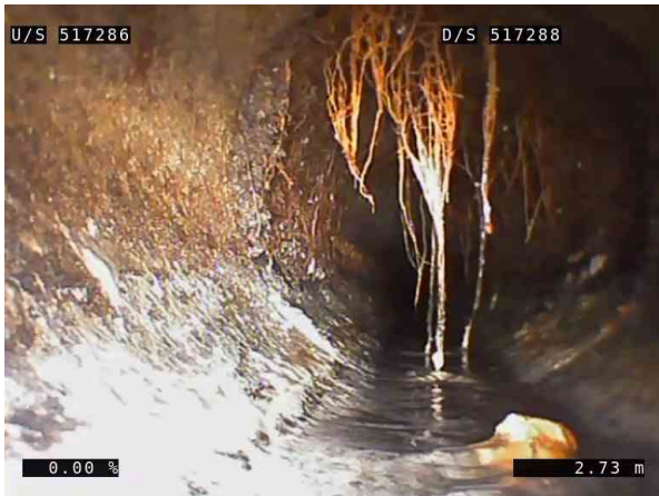
5, 00:01:06, 2.73m (18.27m) Fine roots, restrict flow by 10% to 25% of full flow from 8 o'clock to 4 o'clock