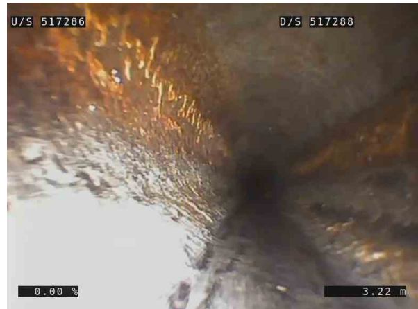
6, 00:01:11, 3.22m (17.78m) Fine roots, restrict flow by 10% to 25% of full flow from 8 o'clock to 4 o'clock