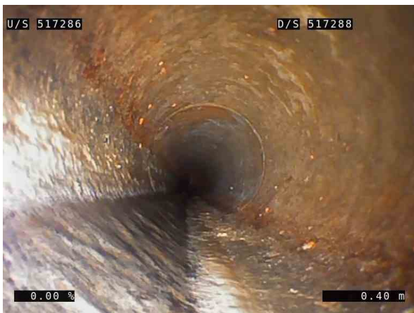
3, 00:00:36, 0.40m (20.60m) Debris greasy, small, clear diameter is reduced by less than 10% from 4 o'clock to 8 o'clock, start / Pipe walls