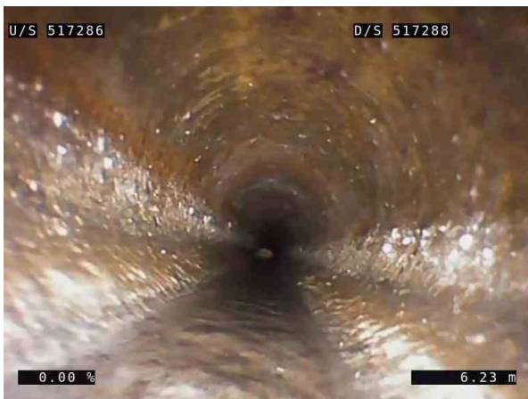
7, 00:01:28, 6.23m (14.77m) Debris silt, small, clear diameter reduced by less than 10%, start / Gravel mud